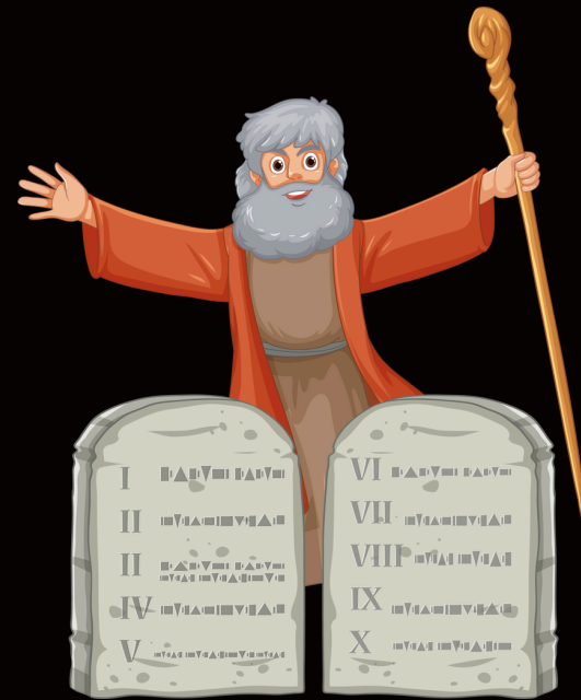
MOSES 1450 BC