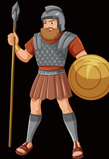
JOSHUA 1410 BC