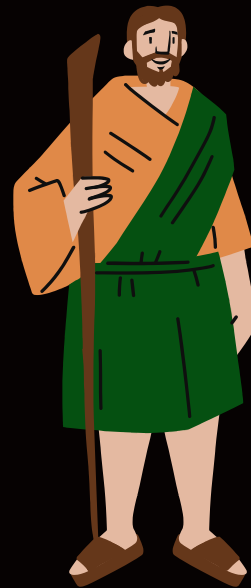
ABRAHAM 2,000 BC