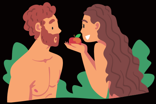
ADAM/EVE 4,000 BC