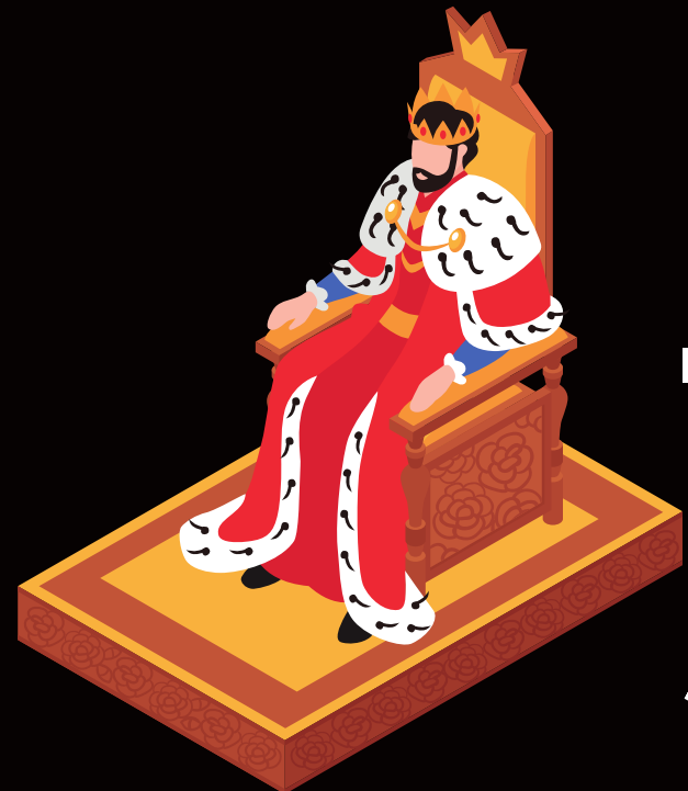
SOLOMON 930 BC