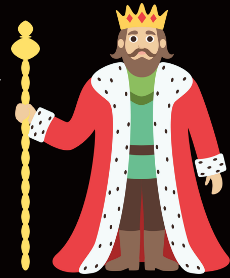
DAVID 1000 BC